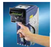
Choose your report and press validator head's lever