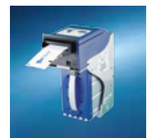
Feed Ticket into validator