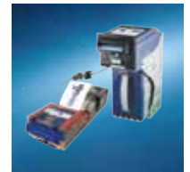
Connect CashCode one™ validator and TITO printer