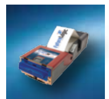
Tool free reports prints automatically