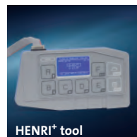
HENRI + tool