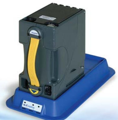
MEI EASITRAX® Reader Base