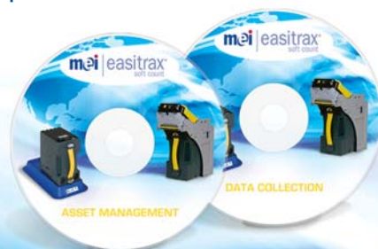
MEI EASITRAX® Software

Please contact your MEI sales associate to learn how MEI EASITRAX® Soft Count can help you eliminate "hot boxes," jurisdictional fines, dedicated cashboxes and increase operational efficiencies.