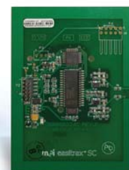
MEI EASITRAX® Antenna Board